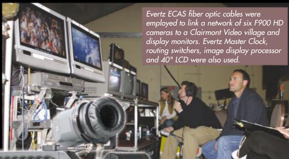
Evertz ECAS fiber optic cables were employed to link a network of six F900 HD cameras to a Clairmont Video village and display monitors. Evertz Master Clock, routing switchers, image display processor and 40" LCD were also used.

OSMOND: "I was initially concerned about how robust the fiber-optic system would be. But in retrospect, we strung that stuff everywhere and it rocked! I can only imagine our plight without the fiber; endless battery changes, BNC hell, wires everywhere and problems galore. Not so with fiber. When a camera would move they could simply unhook one cable and go to another pre-rigged point."