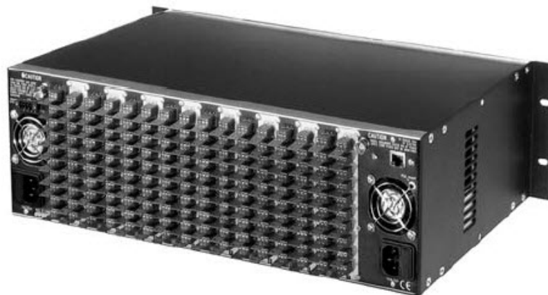
Figure 1-2: 400FR Rear View