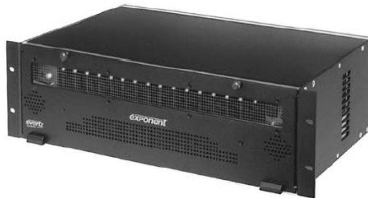
Figure 1-1: 400FR Front View