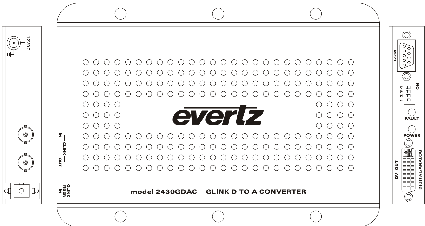
Figure 2-1: 2430GDAC Module Connections

The 2430GDAC is a compact module that has two BNC connectors, one fiber optic connector, one DVI-I connector for video, and one DB-9 serial port connector for upgrades.